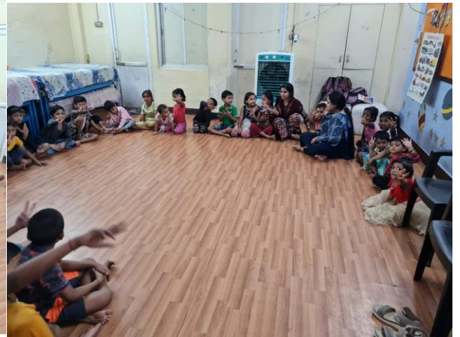
Volunteers of NSS Playing Games with Childrens of Mala Smriti Home