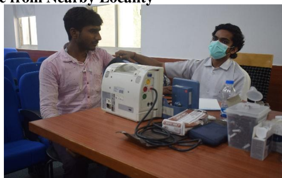
Blood Pressure Checkup