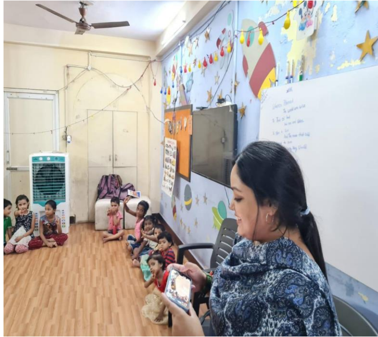
Faculty Coordinator telling story