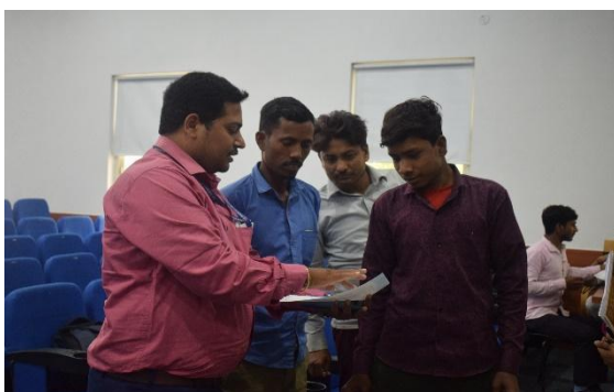
Doctor Explaining the Report