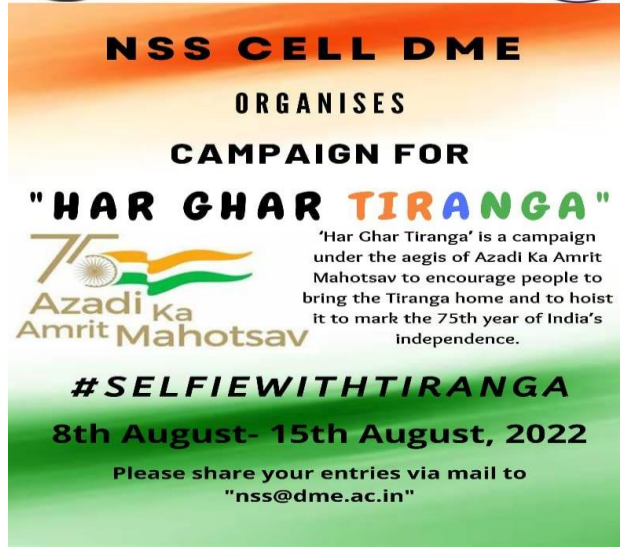
Poster on Campaign for Har Ghar Tiranga