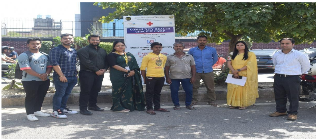
NSS Volunteers with People from Nearby Locality