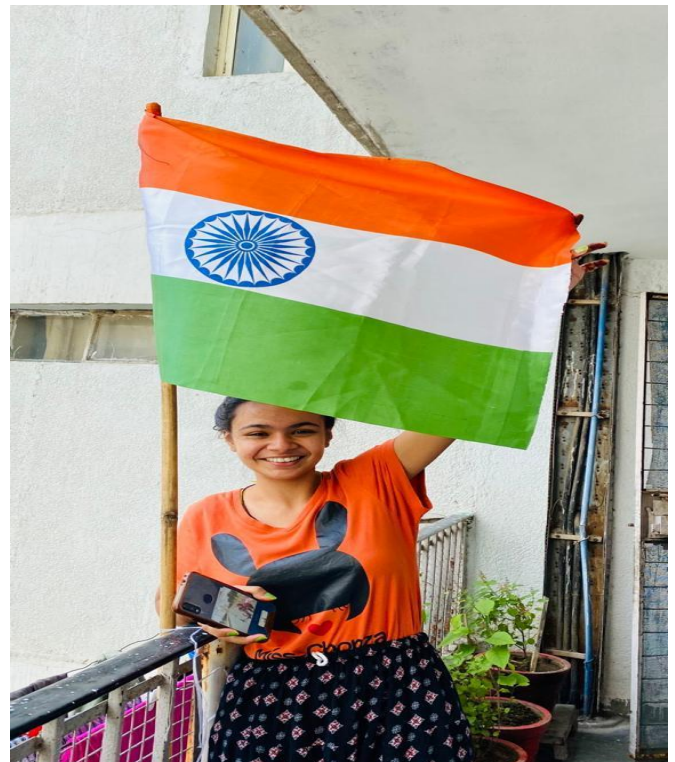
Students with Tiranga