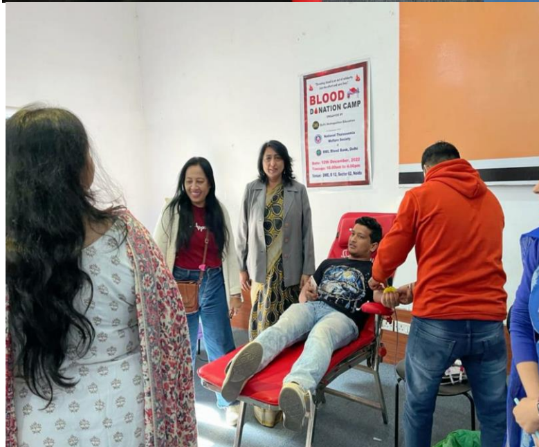
NSS Volunteer Donate Blood