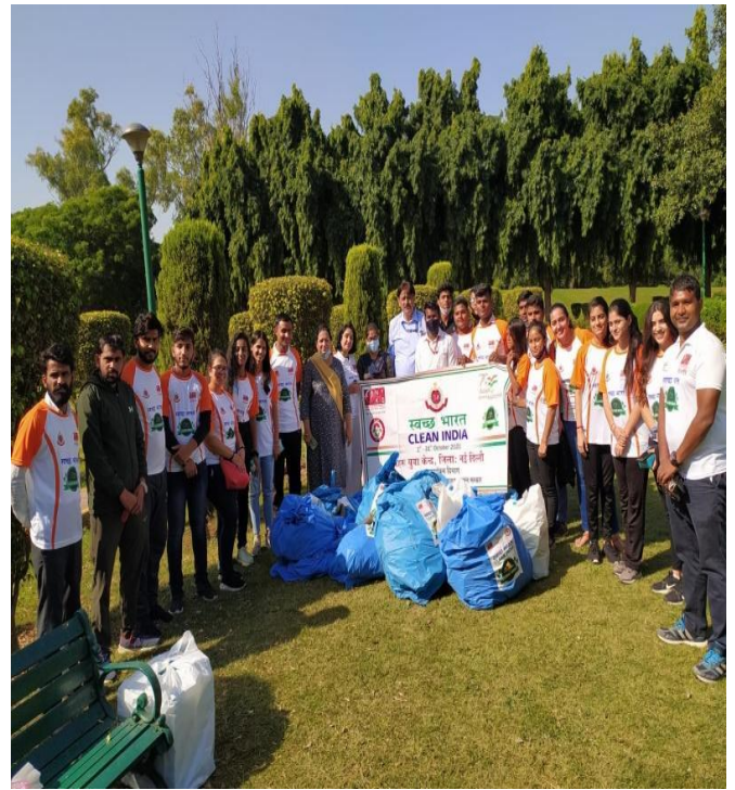
Students with the Garbage Bags