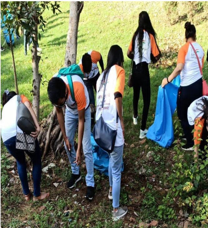
Student Picking the litter from Premises