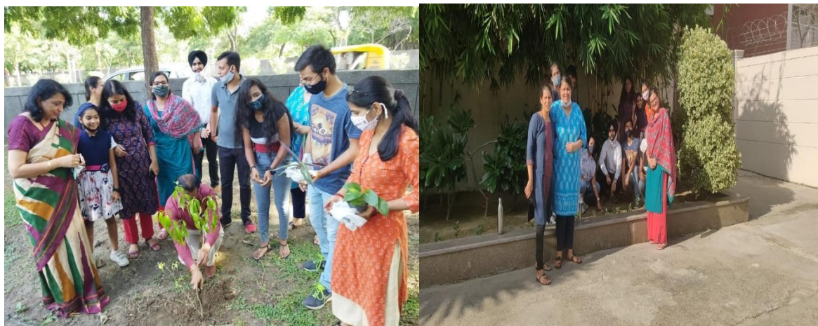
Faculty Members and Students Planting Sapling at Public Park