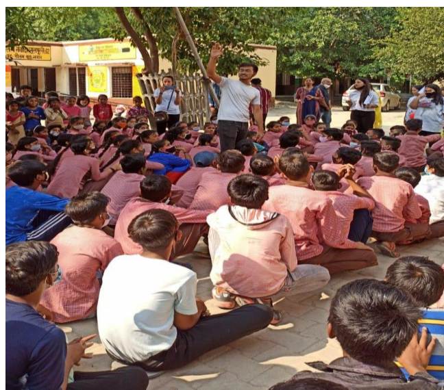
Students doing fun Activities with the Children of Government School