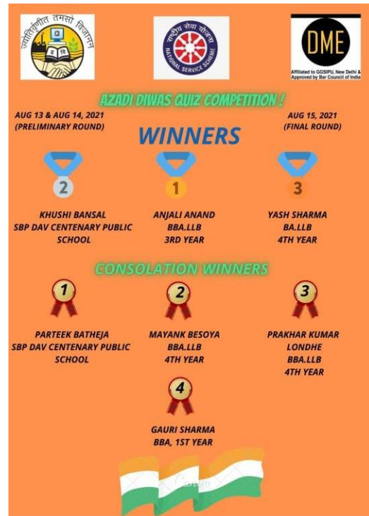
Posters on Azadi Diwas Quiz Competition