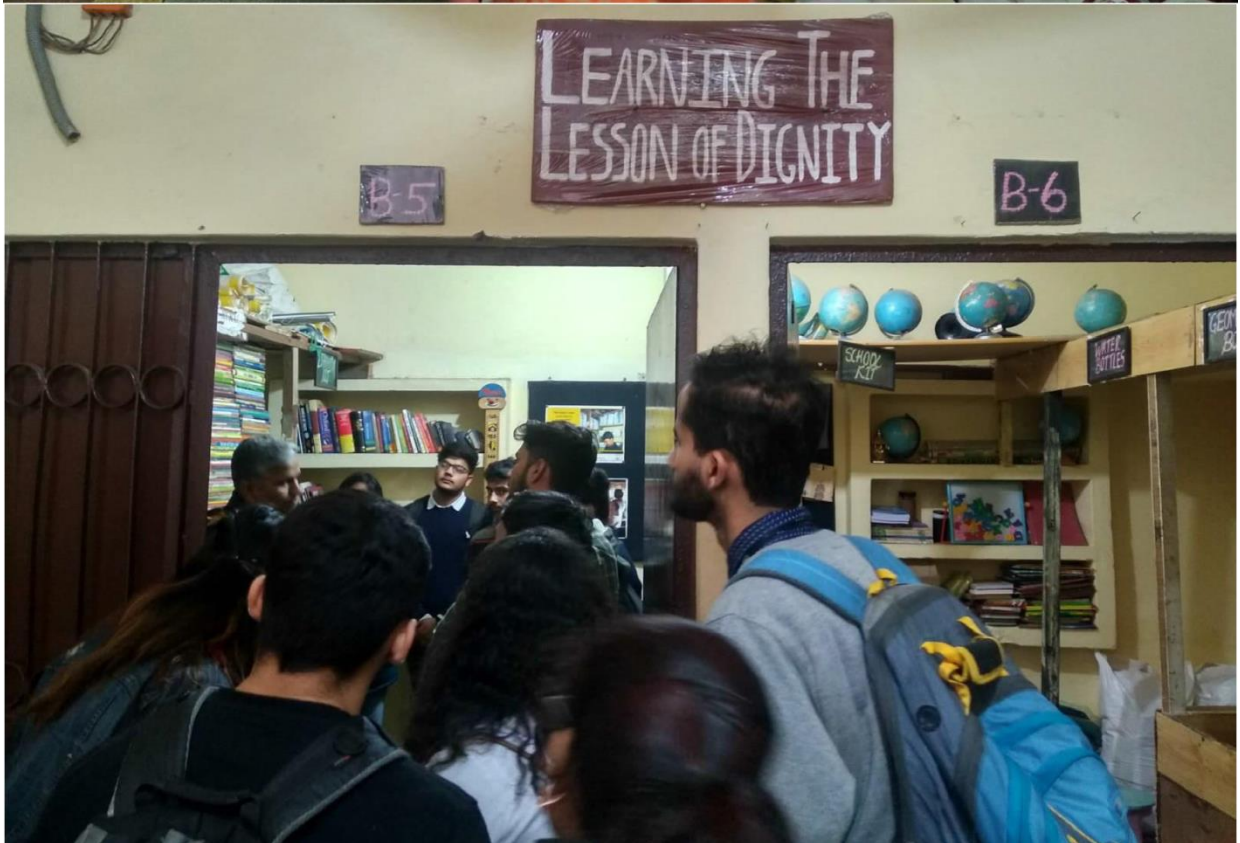
Students exploring the Premises of Goonj