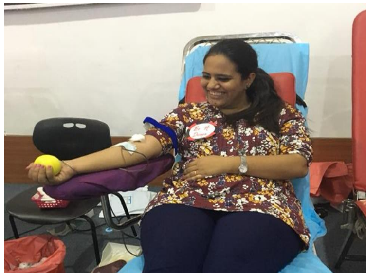
Student volunteering for blood donation during COVID times