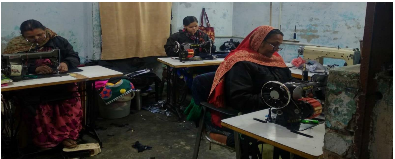
Women at Goonj recycling the donated clothes