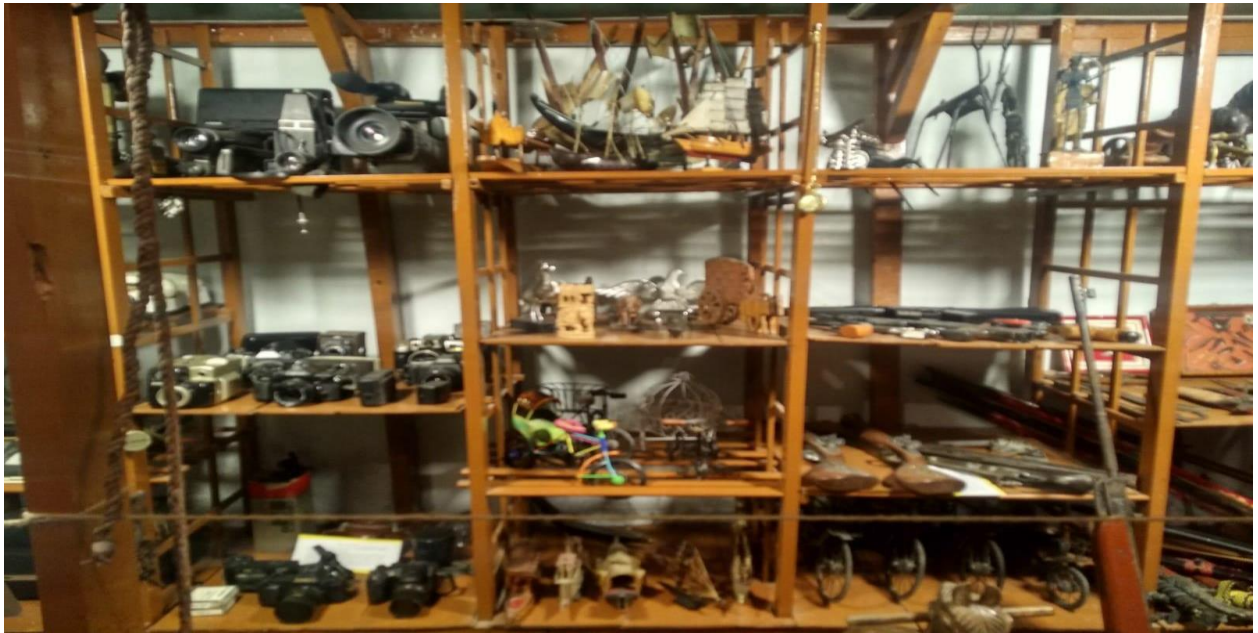
Handicraft products made by women at Goonj