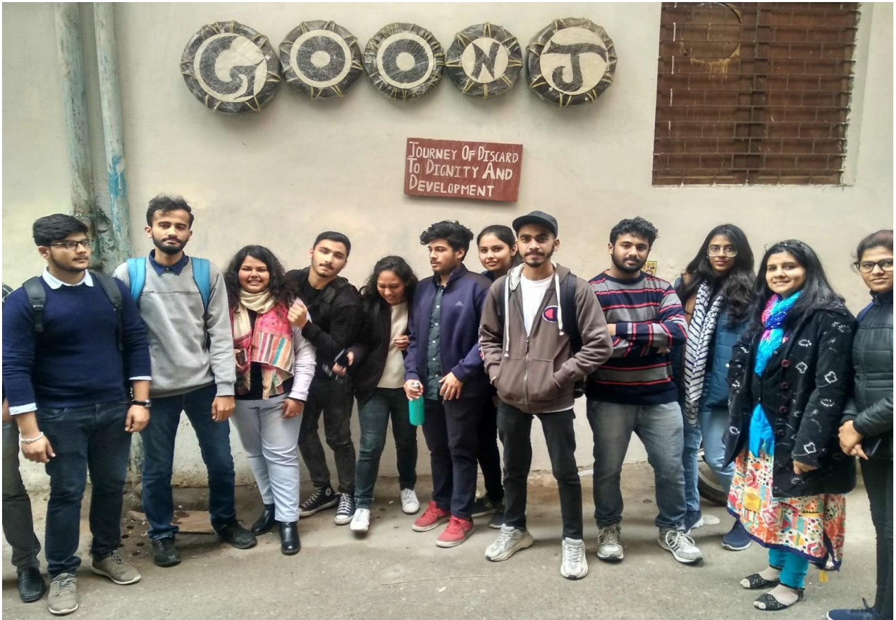
Members of Community Connect at Goonj Foundation