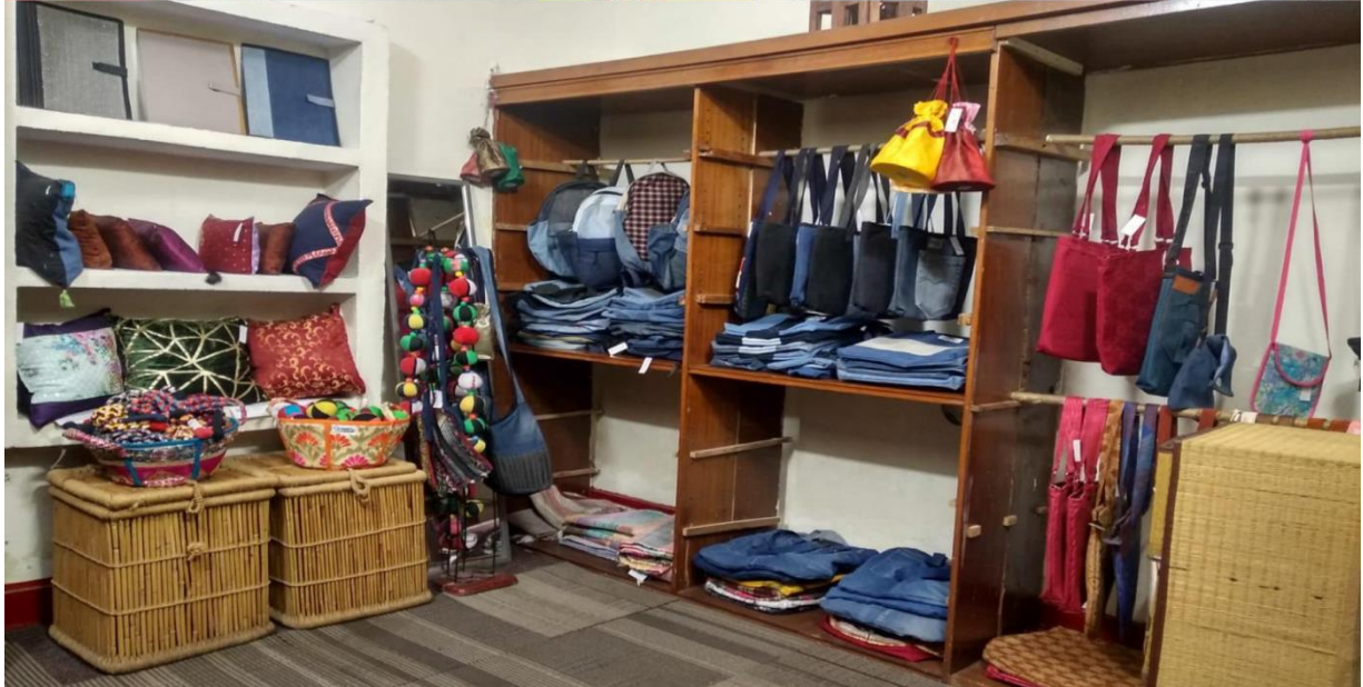
Recycled products at Goonj