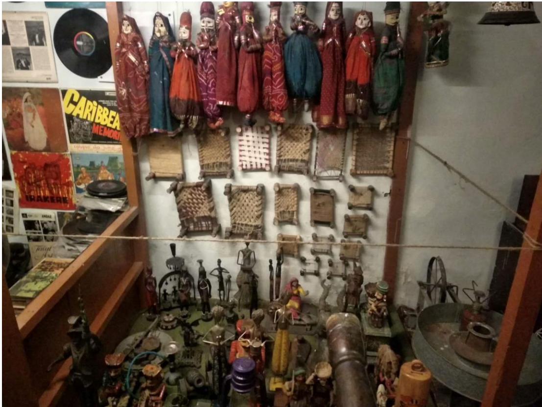
Handicraft items at Goonj