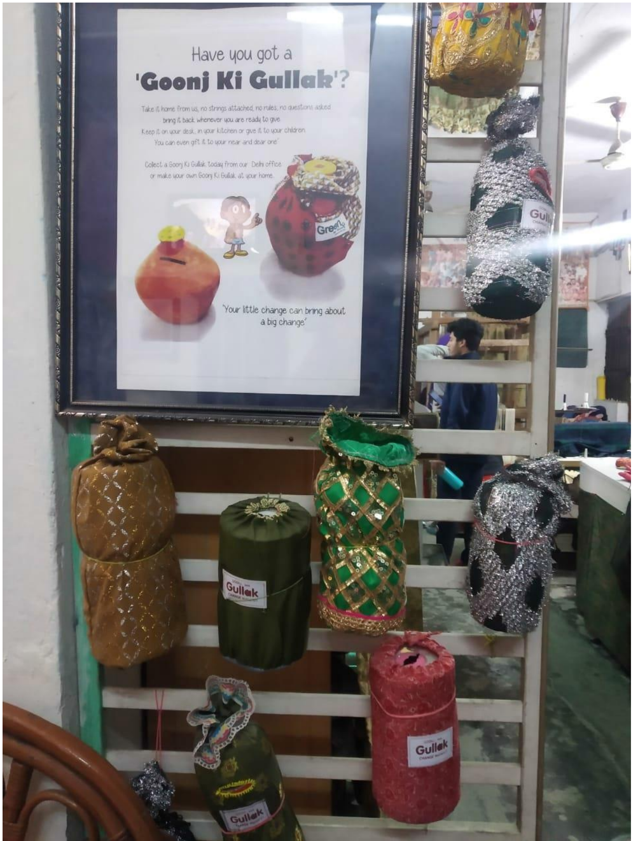
Bags made out of old clothes