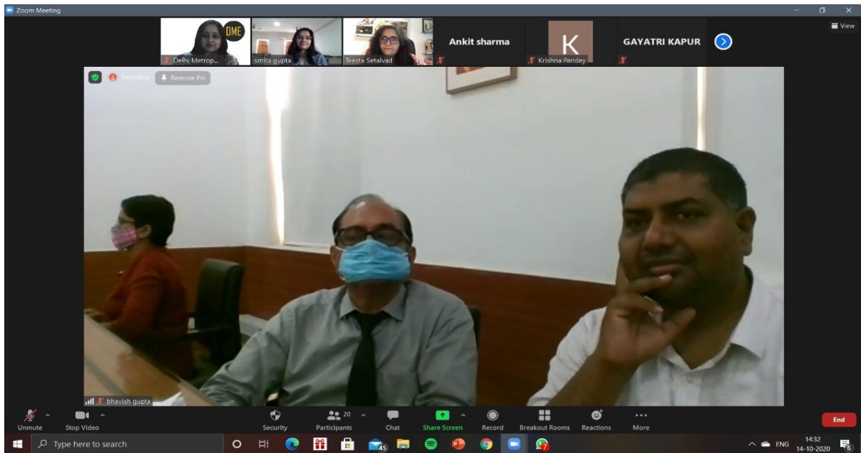
Faculty Members attending lecture