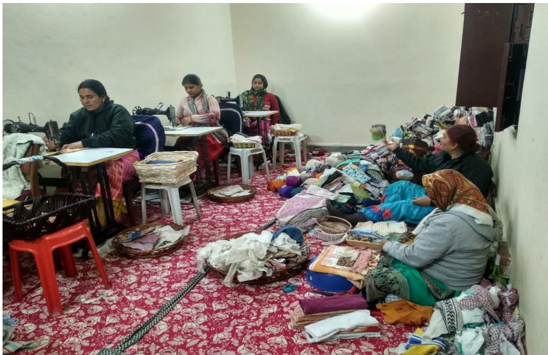
Women ar Goonj making bags out of donated clothes