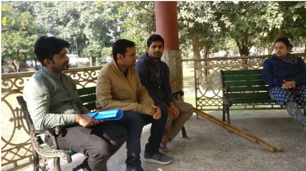
Members of Legal Aid Cell giving advice to people in Hoshiarpur Village

With this, the one-day camp at Hoshiarpur village came to an end.