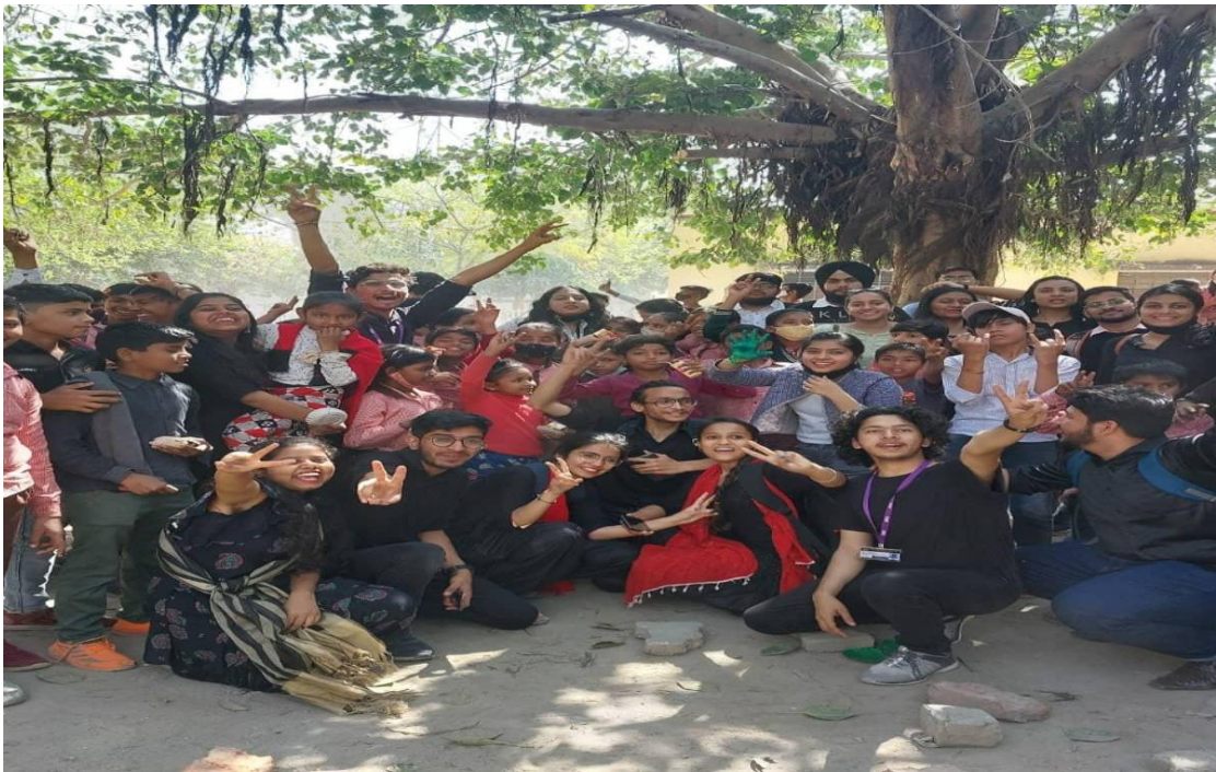
Students and Children from Shelter Home