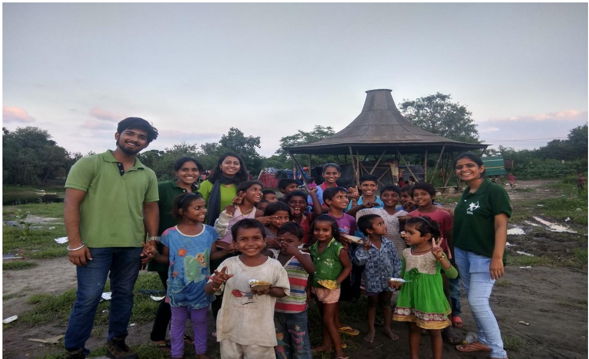
Children enjoying the ice-cream