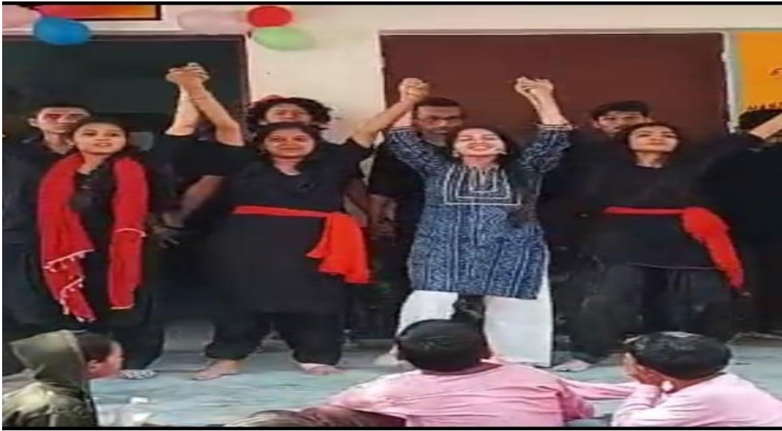
Students performing for children in shelter home