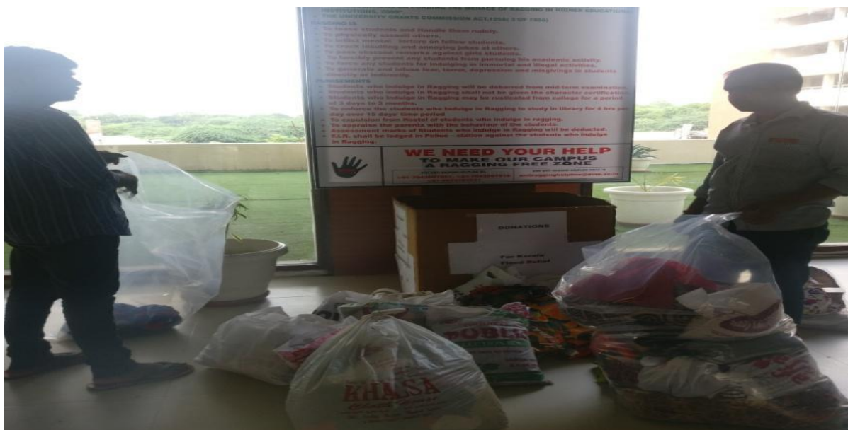
Collection done by Faculty Members and Students

All the collected donations were taken to the NGO – Sarvhit, F -56, Sector 51, Noida, on September 1, 2018. The NGO centre is also working for Kerala relief people and many other areas, so our donations will also be added up and delivered in Kerala. Some of the photographs of the donation drive are attached herewith-