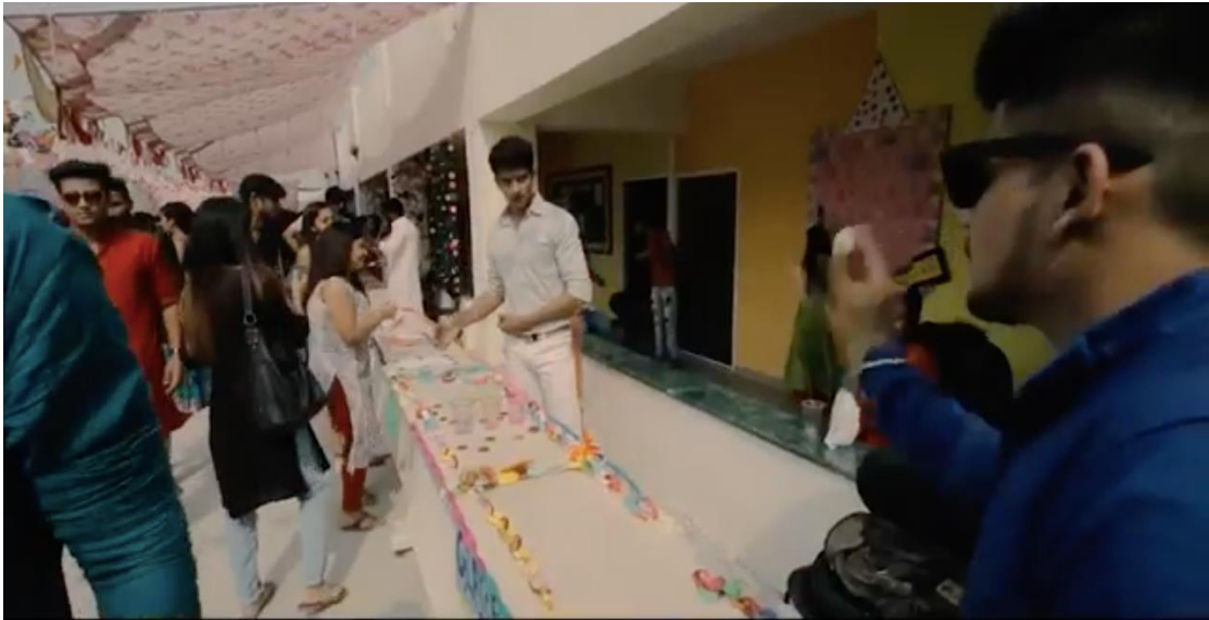
Students relishing the Community Fair