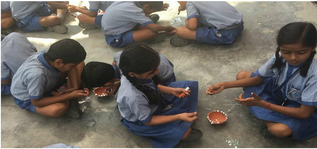
Children Painting Diya