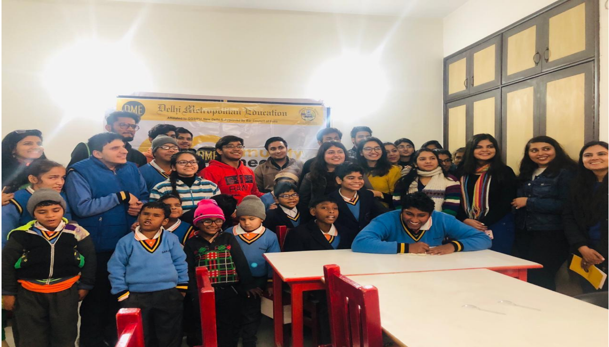
Students of DME playing with Children in Blind Schol