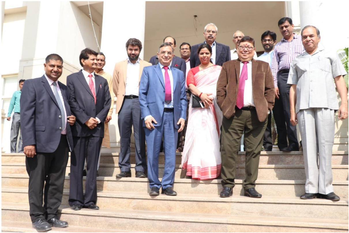
Legal Aid Cell with Chairperson DLSA Gautam Budh Nagar