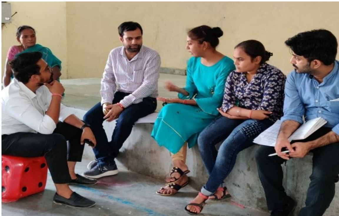
Members of Legal Aid Cell interacting with people from nearby locality