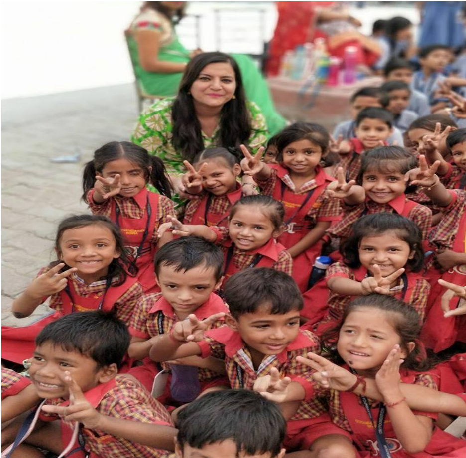
Children enjoying and Smiling