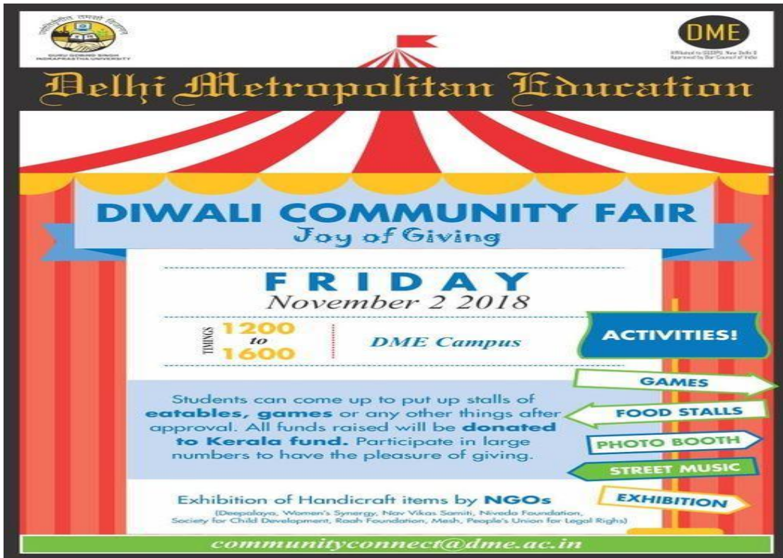
Poster for Diwali Community Fair