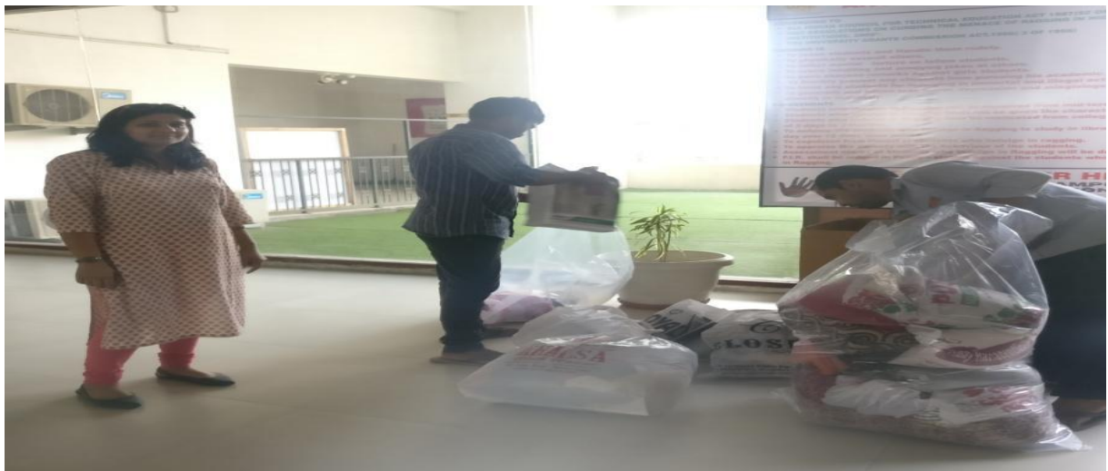
Packing the bags