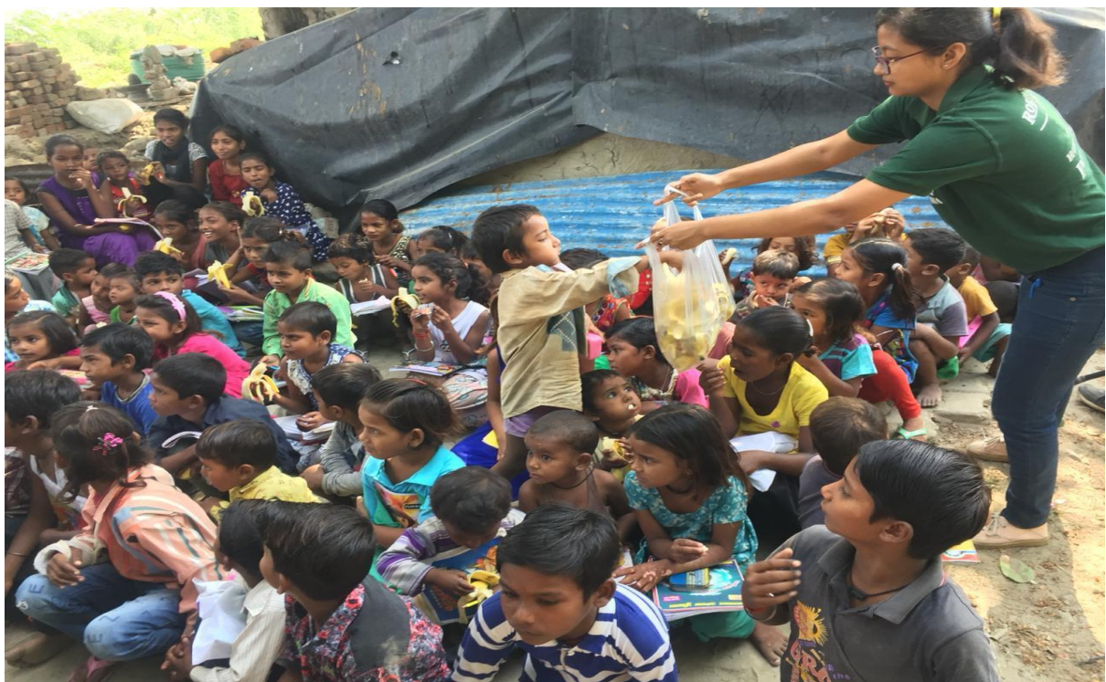
Students of DME Bananas to children