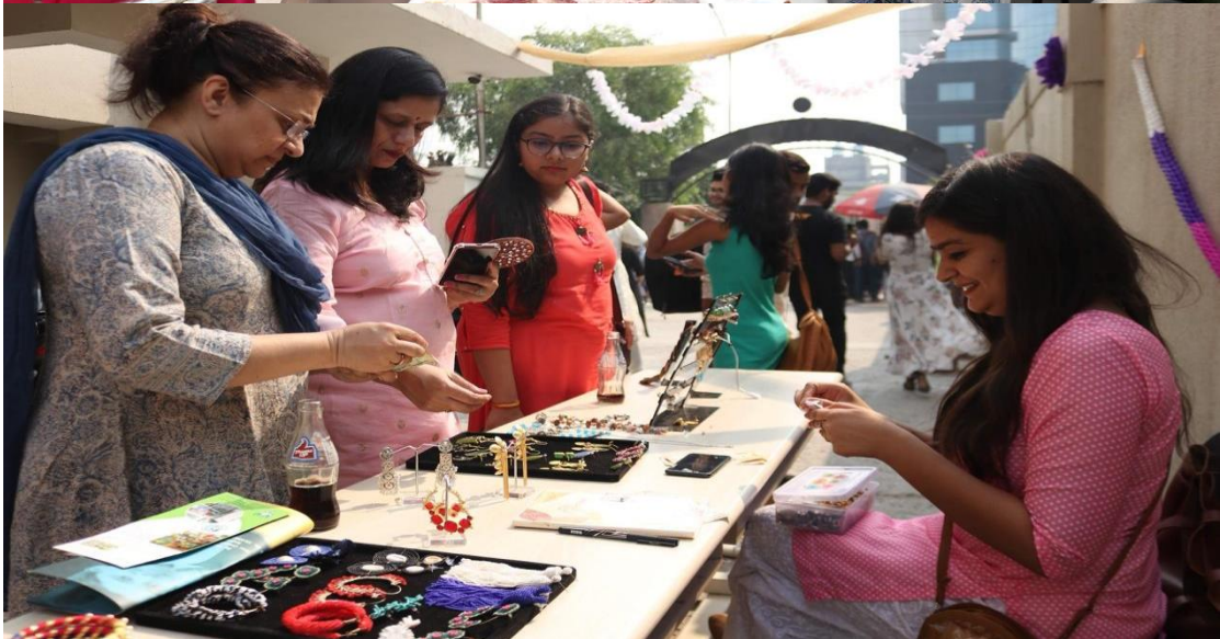
Stalls displayed by the NGO's