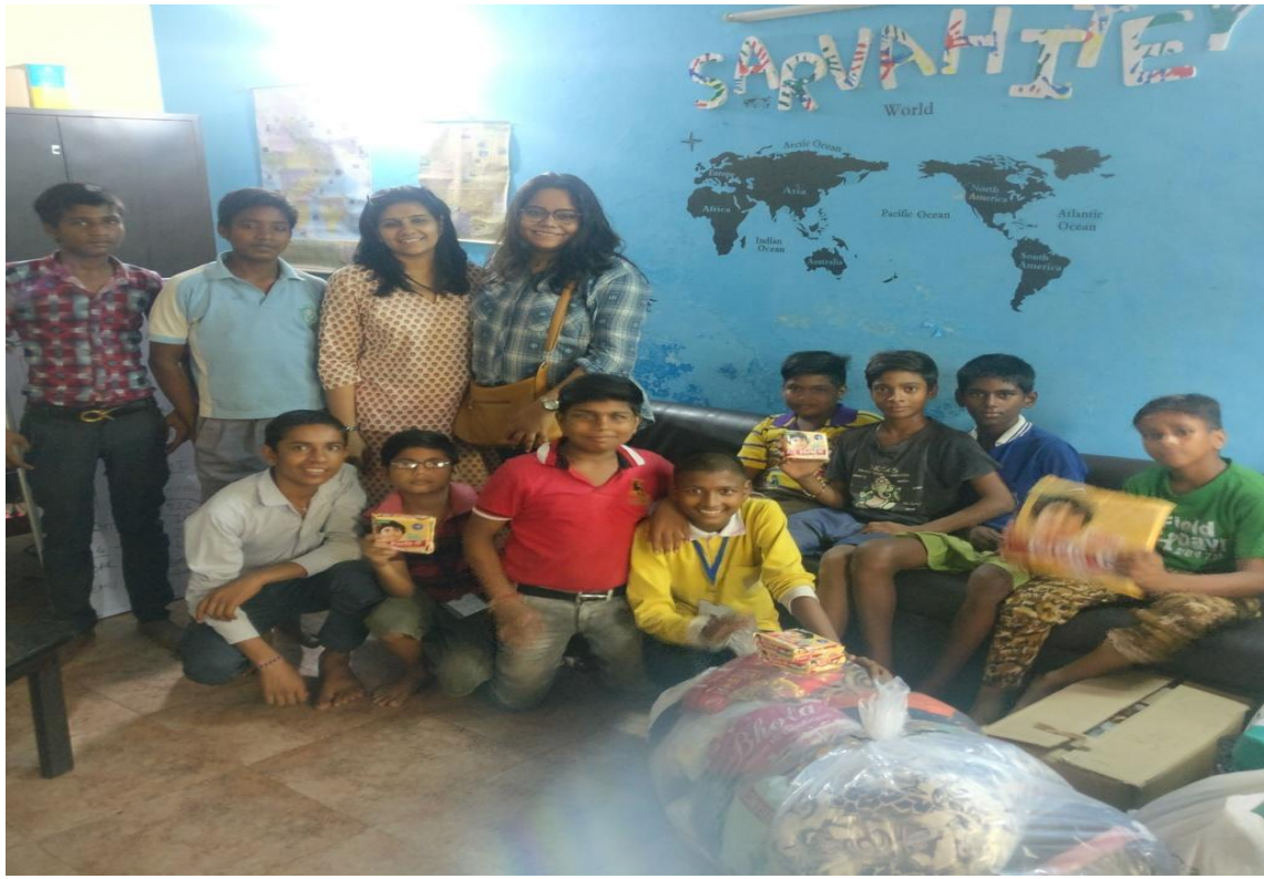
Happy Faces after getting the donated items