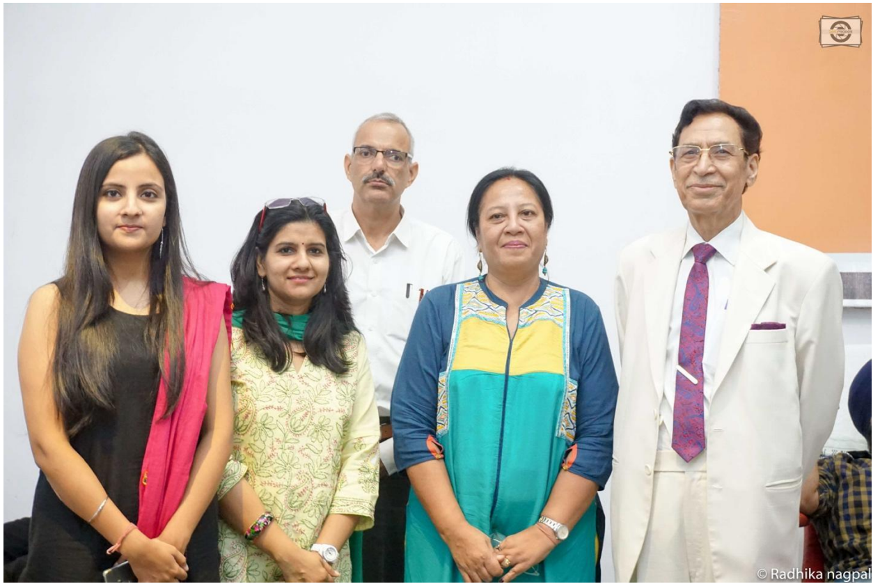
Members of Community Connect Cell