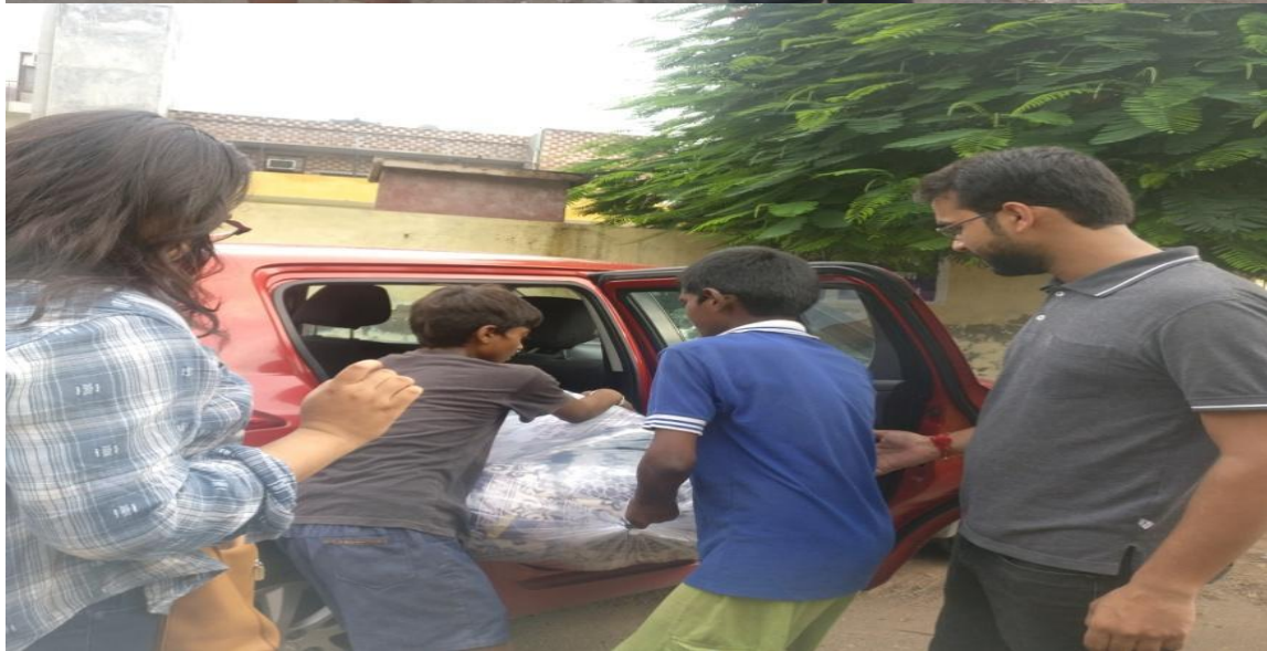
Children taking out items from Vehicle