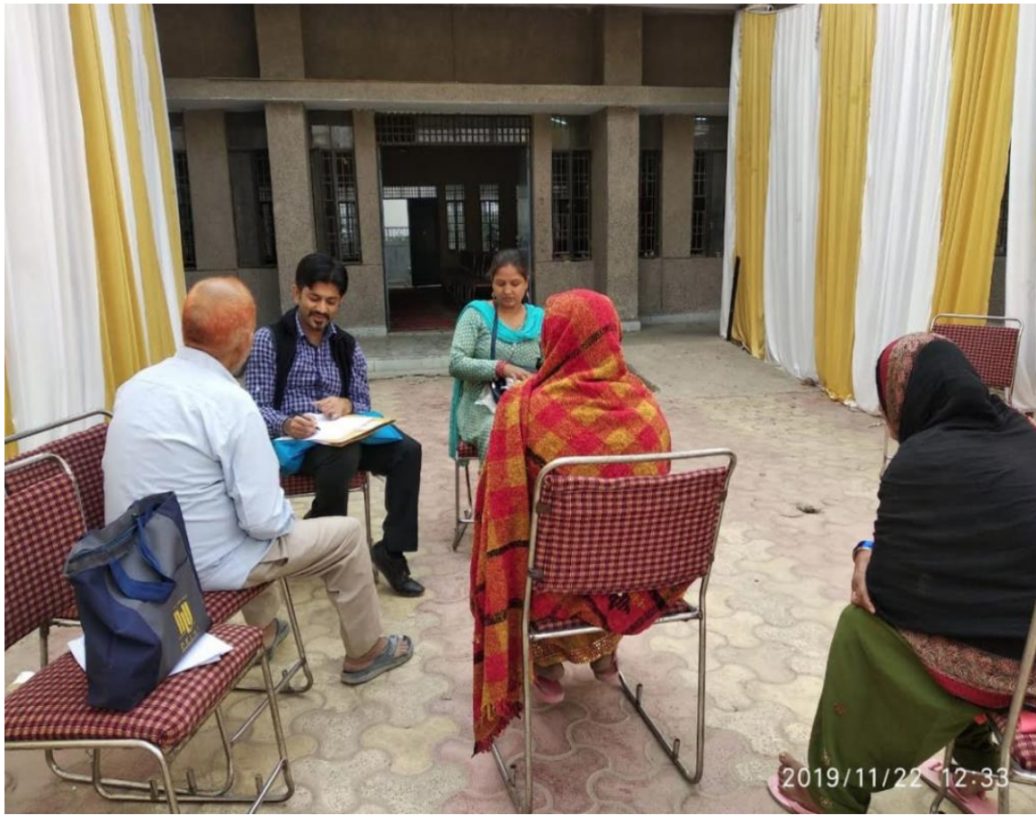
Members of Legal Aid Cell giving advice to people