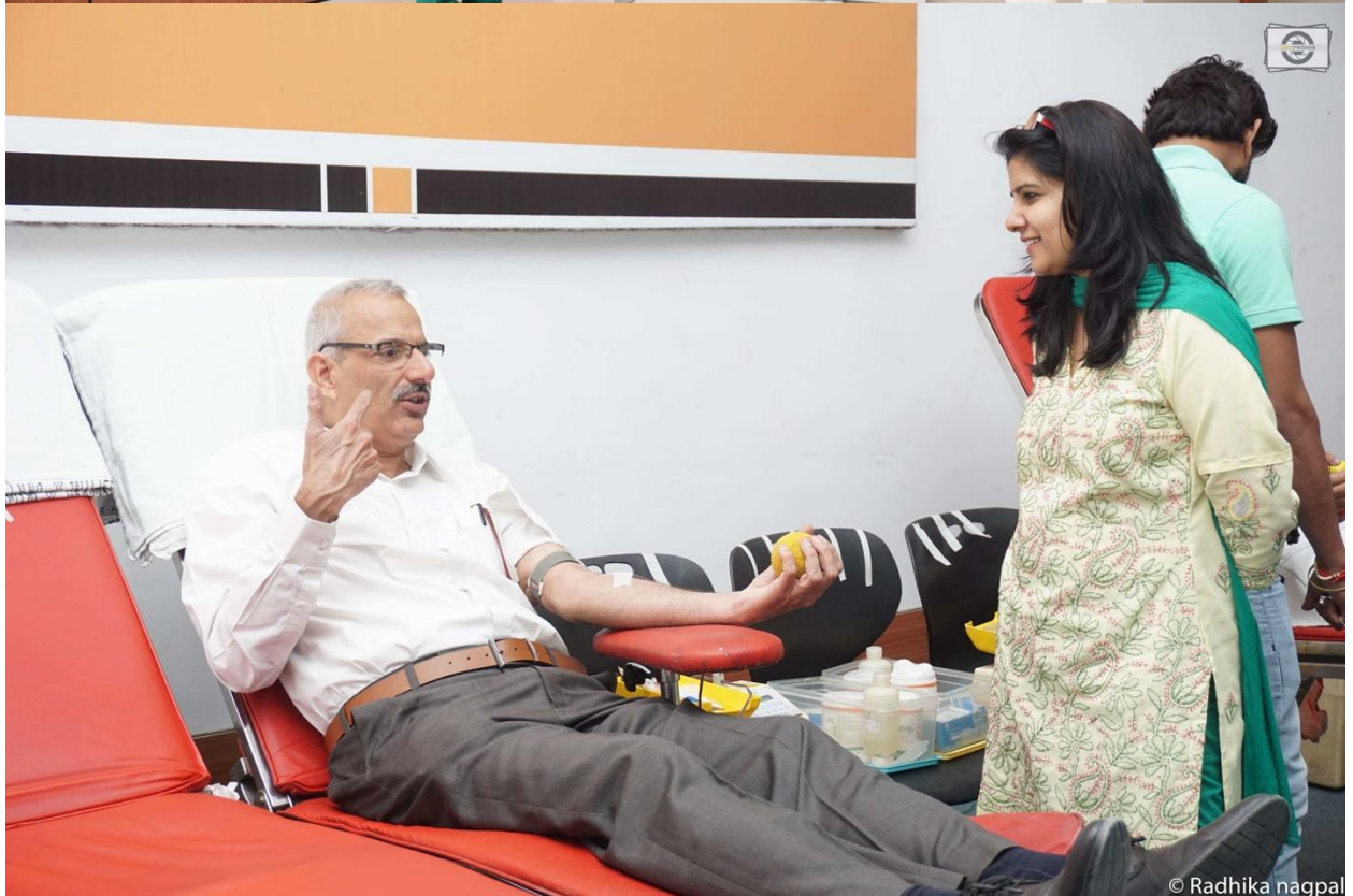
Director Sir donating blood