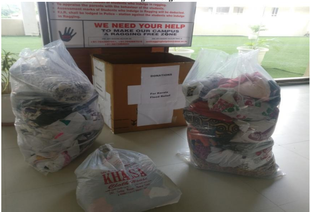
Bags ready to be delivered to the victims of Kerela Floods