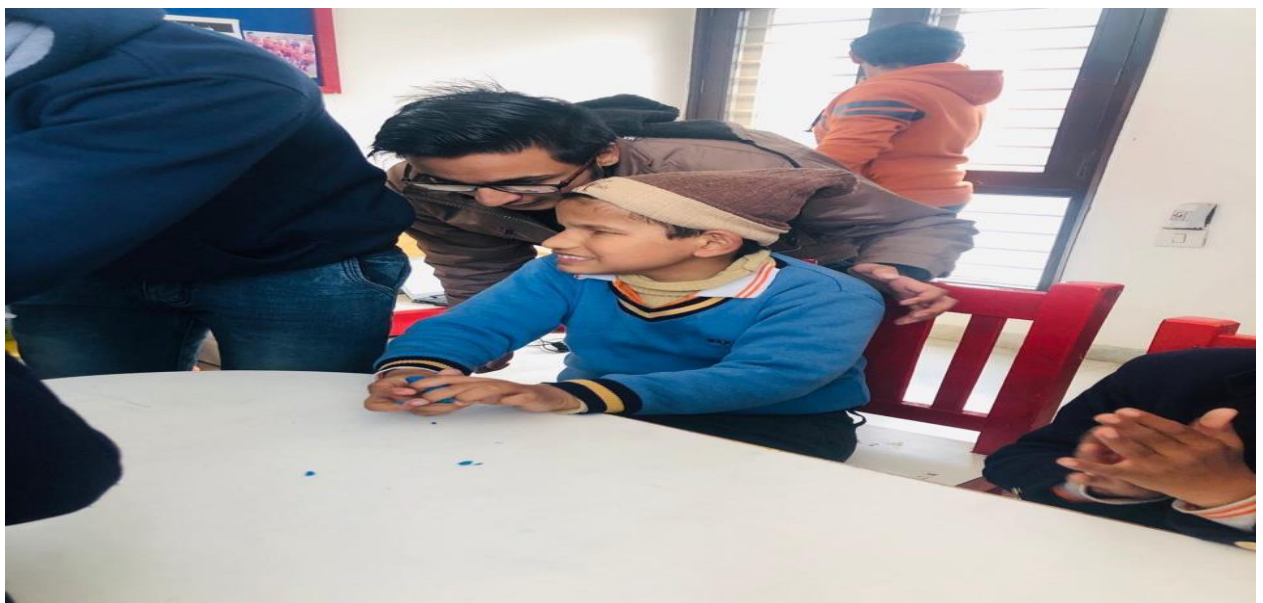
Students of DME interacting with children in Blind School

The event was a success and turned out fruitful concerning the purpose for which it was initiated. Children with multiple disabilities were thrilled and cheered, clapped and danced enthusiastically. DME constantly tries to conduct such activities, which helps inculcate a sense of compassion towards underprivileged children and respect them equally, irrespective of their differences.