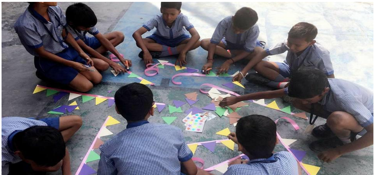
Children doing activity on Diwali