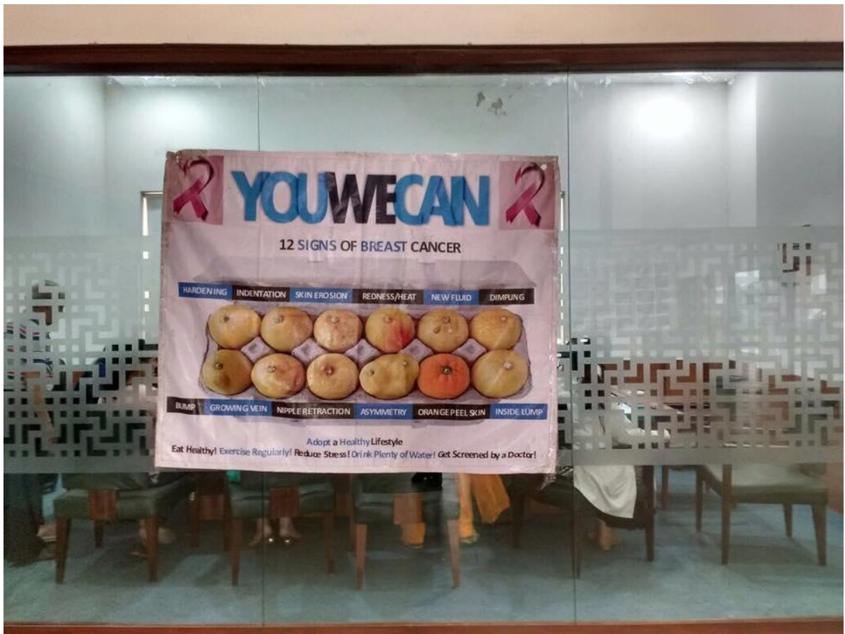
Poster on Sign of Breast Cancer