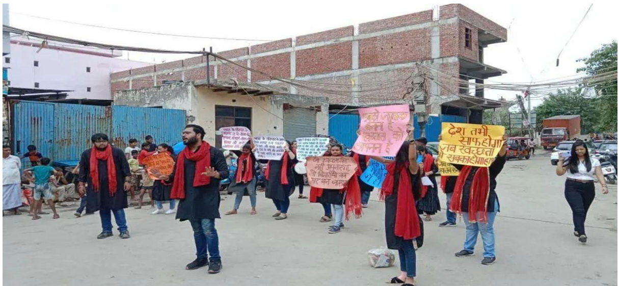
Students performing Street Play on Cleanliness in Community