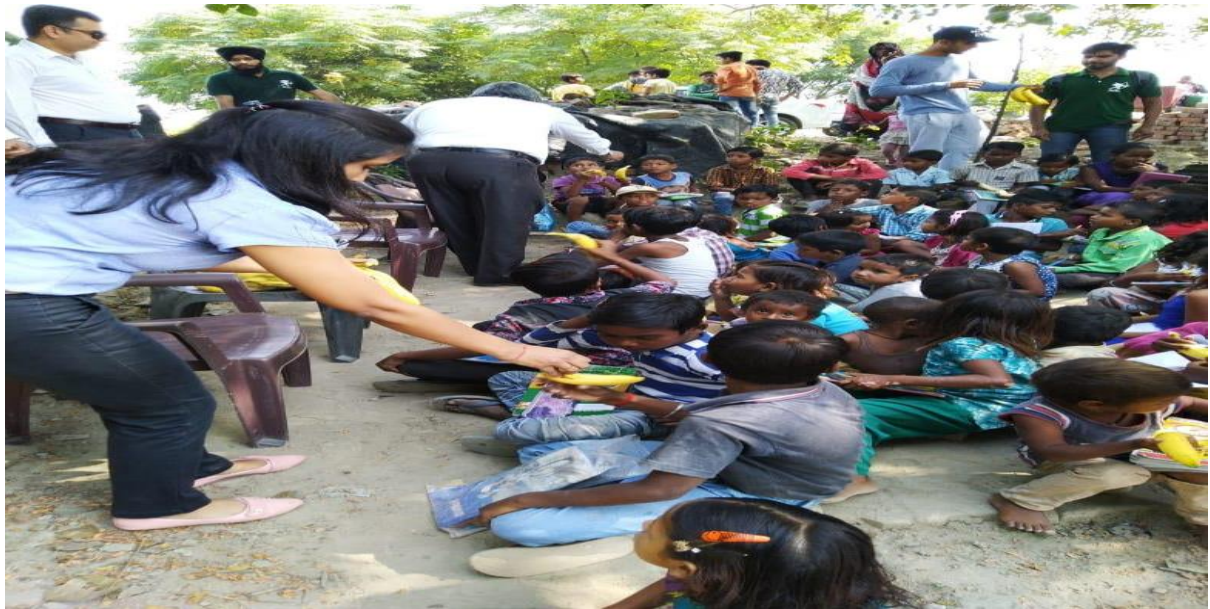
Children enjoying the food