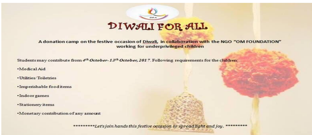
Poster on Diwali for All