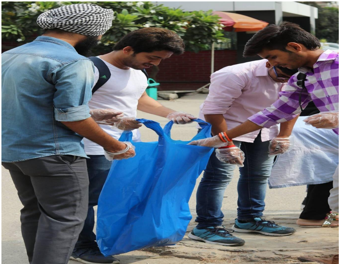
Students Cleaning the premises