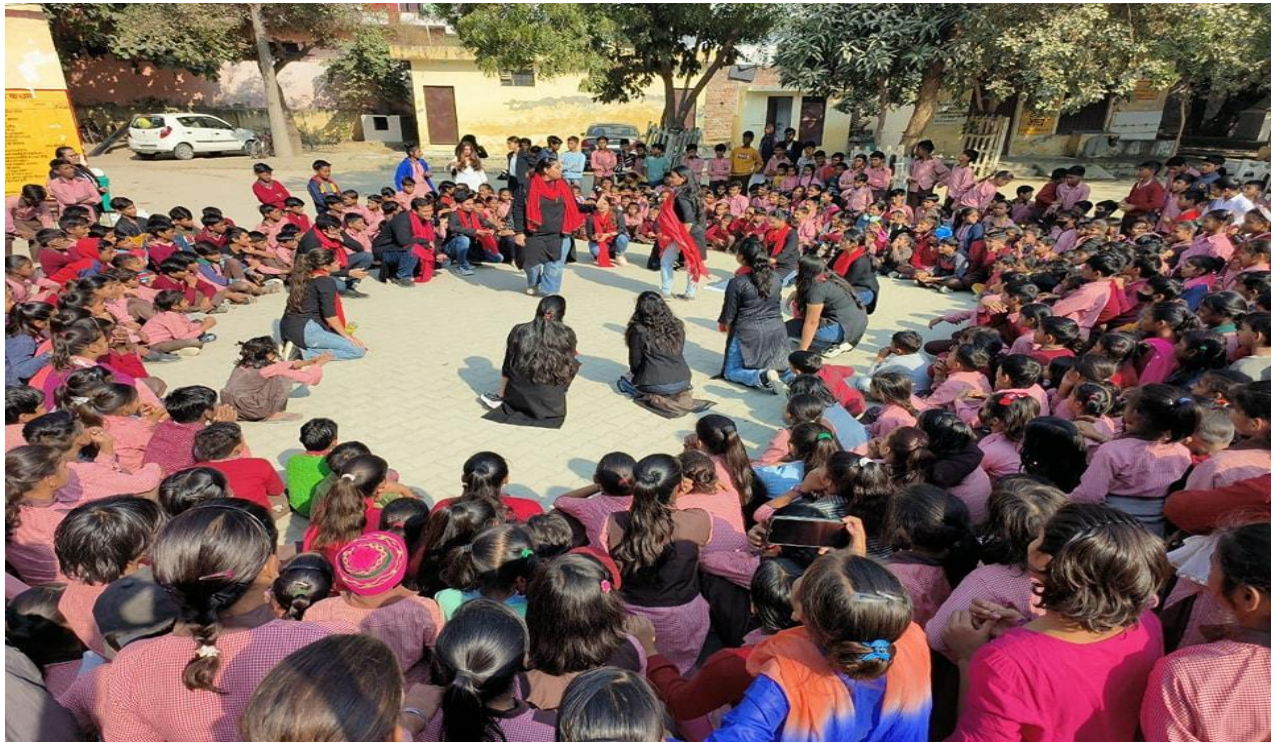
Demonstrating about rights of girl child through Street Play