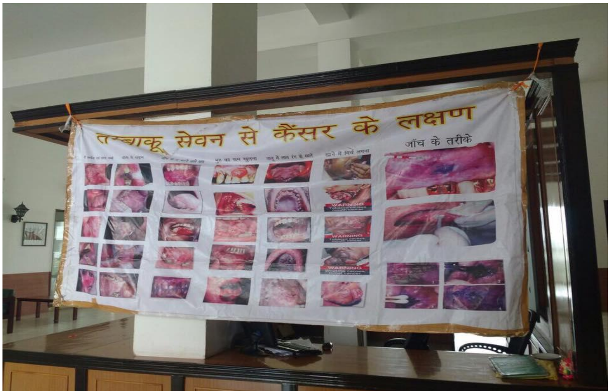
Poster on Symptoms of Cancer