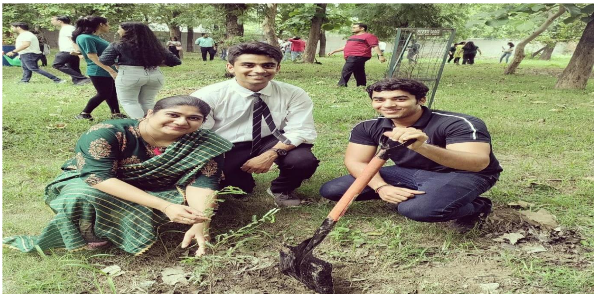
Happy Faces after planting sapling

The college collected 80 saplings from the government nursery. The staff and students of various classes planted saplings in the school's garden to raise awareness and consciousness about the environment among the masses. The drive was a huge success, empowering students with substantial knowledge. Tree plantation is not just something that should be done; it is a necessity, the urgent need of the hour. Planting trees is especially important to protect our environment against air pollution and global warming.