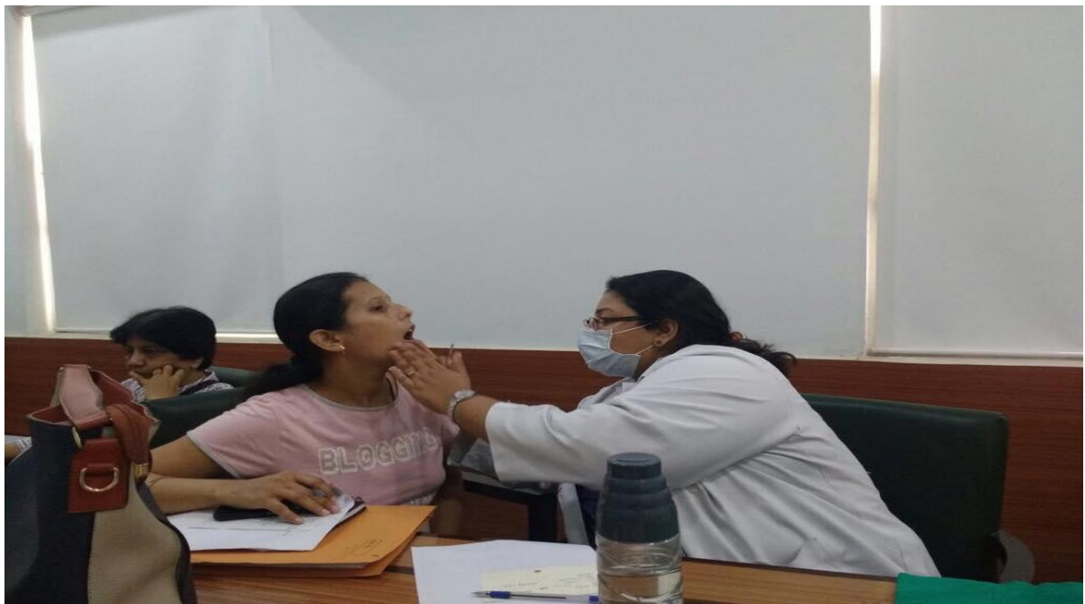
Faculty members undergoing Check up