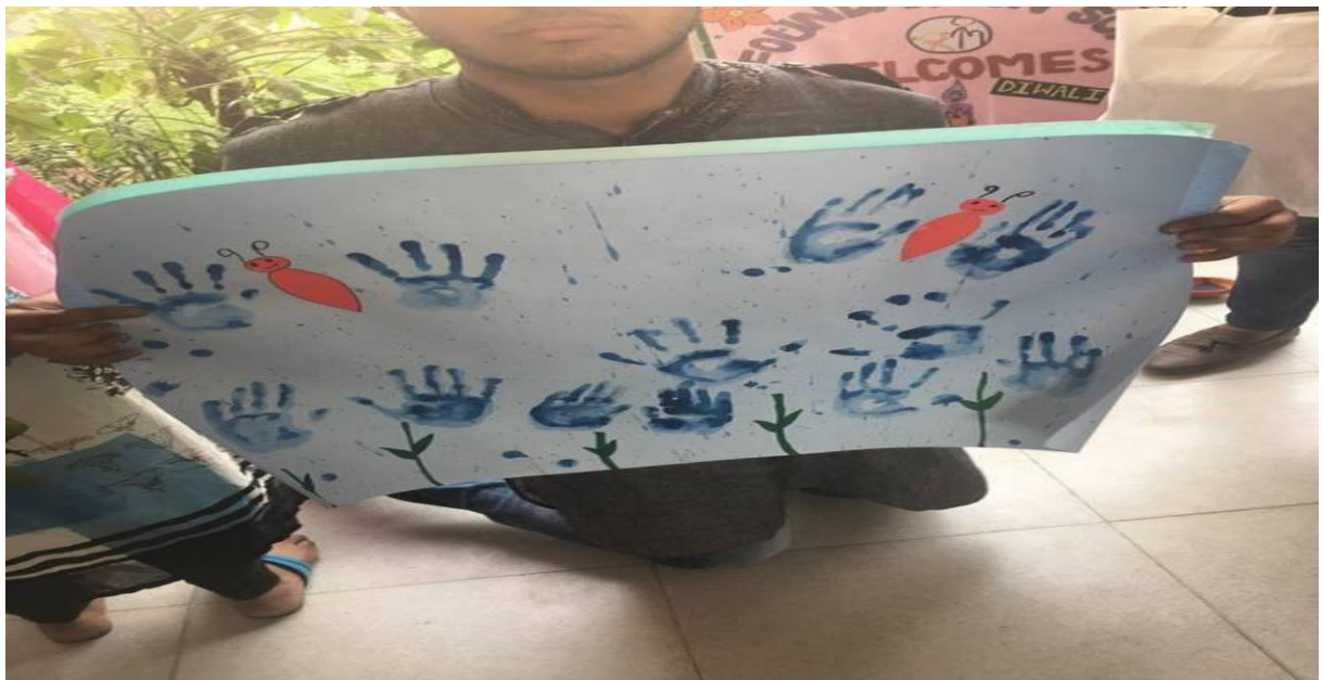
Children showing their activity