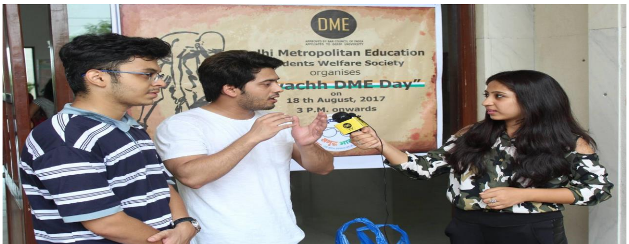
Students giving their views on Cleanliness