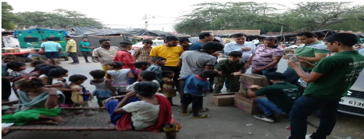
Children waiting for their turn