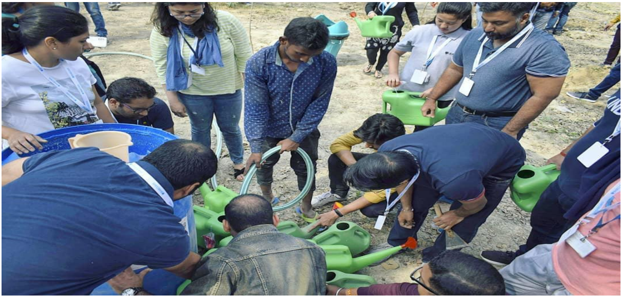
Filling Water Cans to nurture the sapling