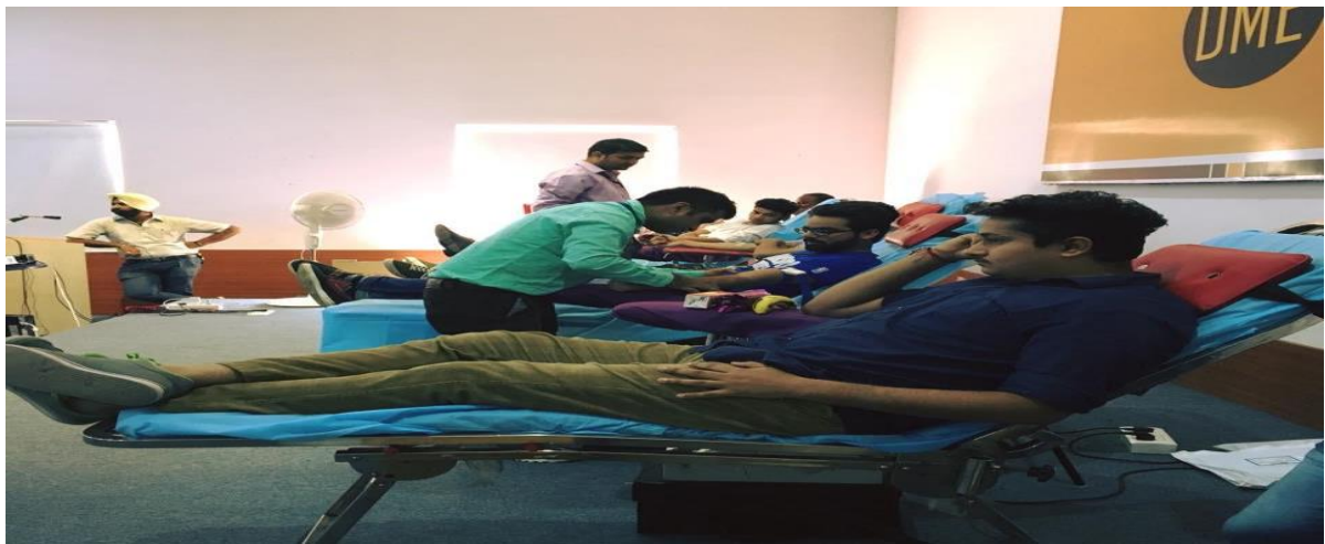
Students donating blood