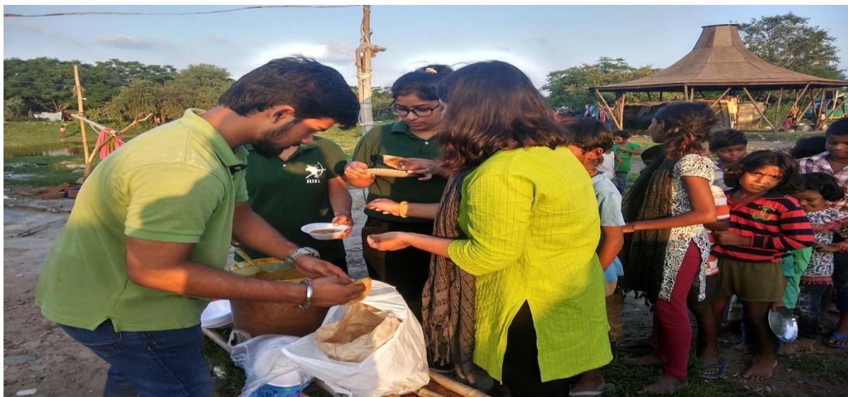
Students Distributing food in slum

All the meals and drinking water were distributed to homeless families around these areas. Most of them were touched by the gesture and congratulated all the team members for the good deed. It was a wonderful experience for everyone, and many experienced heart-handling moments on seeing the joy on the little children's faces when they were being given their meal. All the students gathered back at 2:00 pm near the college, briefly discussed the day's experience, and dispersed to their respective homes with hearts filled with the 'Joy of Giving'.