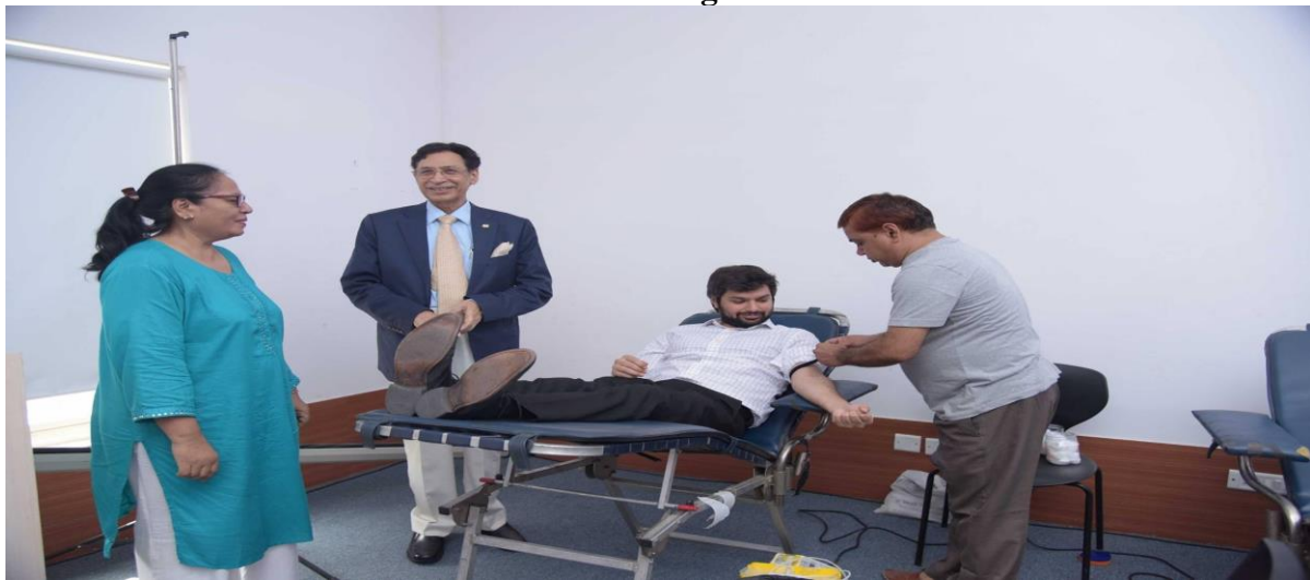
Our Vice Chairman Sir donating blood