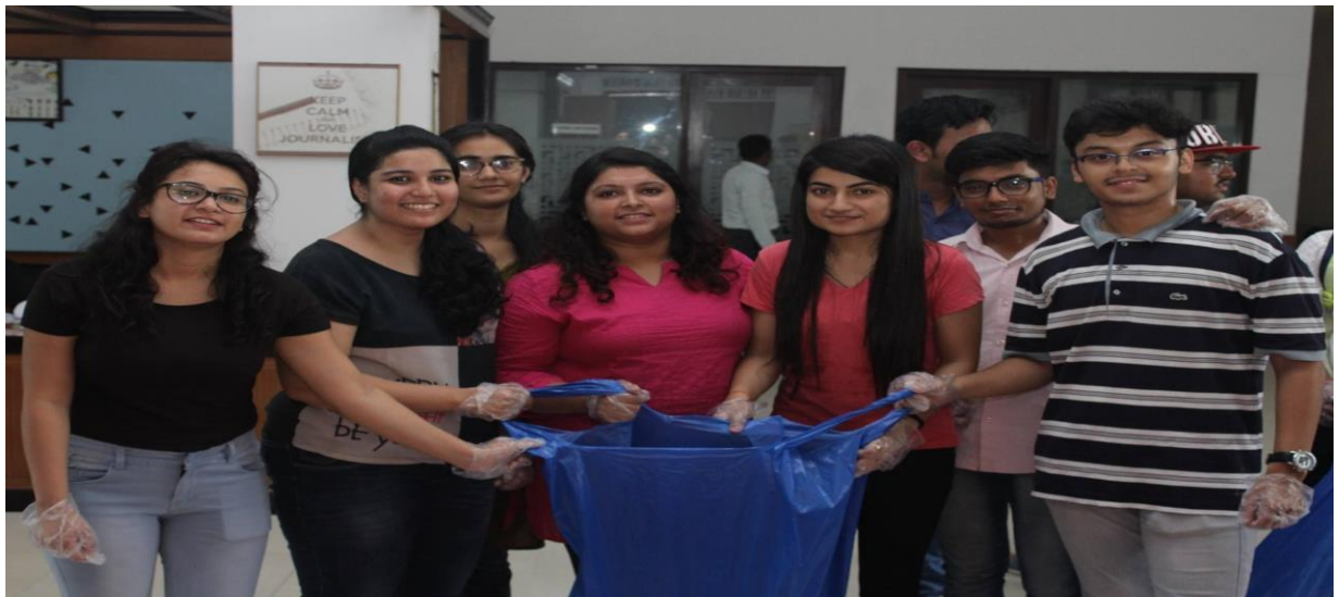
Students Cleaning the Campus