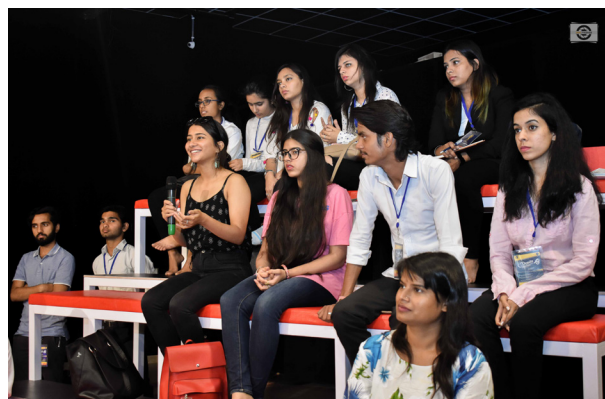
Student raising a point during interaction

The session involved screening of five short