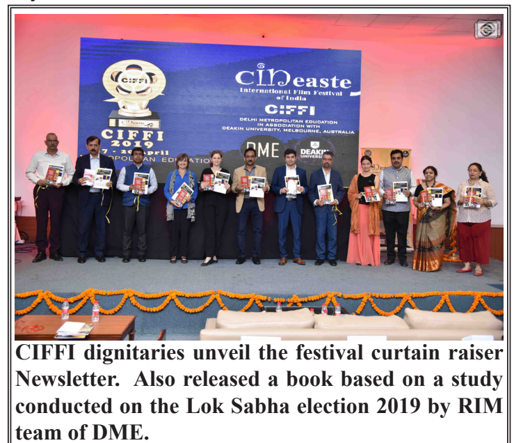
CIFFI dignitaries unveil the festival curtain raiser Newsletter. Also released a book based on a study conducted on the Lok Sabha election 2019 by RIM team of DME.