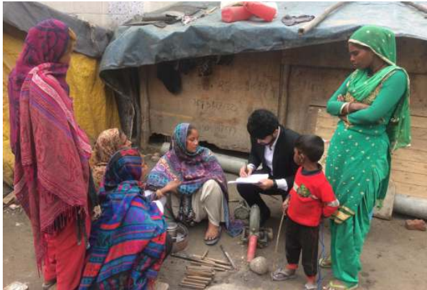
Students interacting with the women of village

In pursuance of our commitment towards the aspiration of free legal aid for all underprivileged, a legal aid camp was organized in our adoptee village of Hoshiyarpur on 7th and 8th February, 2019 by the Legal Aid Clinic, DME Law School. The survey team consisting of both students and faculty members scouted the entire village of Hoshiyarpur to collect data samples and potential cases to be forwarded to the District Legal Services Authority, NOIDA. The data was collected from the village to ascertain the specific areas which are litigious for the villagers so that a targeted legal aid can be provided. This survey shall not only have juridical value but shall be helpful for academic purposes as well.