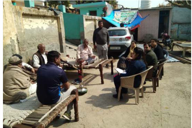
Faculty interacting with the Panchayat

given community. Another demand that arose from the village was the need to give due recognition to the village of Hoshiyarpur in public landmarks. It was after all on the acquired land of this village that the ultra development of sector 51 has happened. This also presents a wonderful opportunity to file a PIL to address the demands of the villagers.