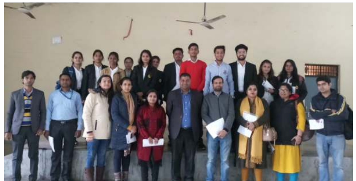
Legal Aid Team of DME

With this, the two day Legal Aid Clinic camp and survey came to a fruitful end.