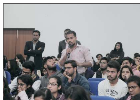
Questions that quench the thirst of knowledge