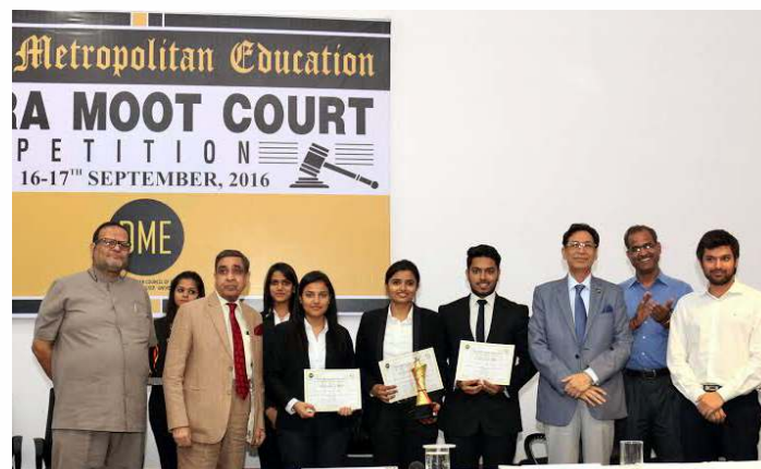
Delhi Metropolitan Education Awards Certificates and Trophies to Moot Court Winners