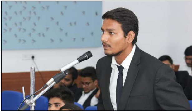
Mooters present their arguments before the Hon'ble Bench

On 16 September, the Moot Court Competition began in earnest, as determined students braved a whirlwind of questioning and probing that would test their research, confidence, courtroom etiquette, and ability to think on their feet. The mooting rounds for different years were held simultaneously in separate classes, collectively engendering a lively air that crackled with the electricity of energised young mooters determined to give their best to the event. The students of the Second, Third and Fourth years were given different topics according to their abilities – on complex notions of surrogacy, motherhood, and the best interests of the child; on questions of customary dissolution of marriage, cruelty, and maintenance; and on the clash of international economic law with the right to development, environment and fulfilment of human rights of an underdeveloped country.