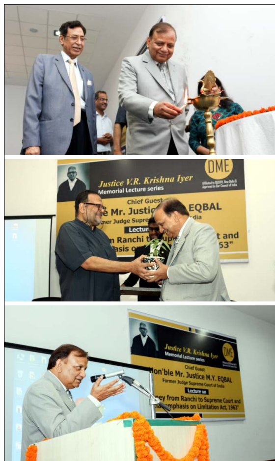
Hon'ble Mr Justice MY Eqbal lighting the lamp (top), being felicitated (centre) and interacting with the law students (bottom)

National Law Conference on 'Environmental Jurisprudence in India' – 12 November 2016