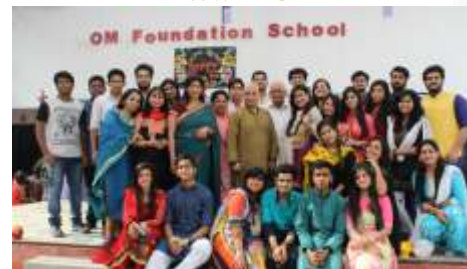
Faculty & students celebrating Diwali with Om Foundation

On October 28, Delhi Metropolitan Education organised its annual 'Diwali for All' donation camp under the initiative of Community Connect Project to make this Diwali a special occasion for underprivileged children in collaboration with NGO, ' Om Foundation '.