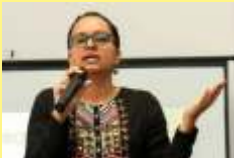
Drug awareness program by the members of NGO Honour ..... contd. page 2