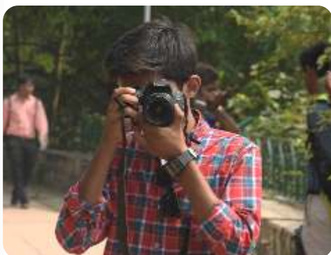
A Student clicking a picture during the Photo Walk

On October 7, the freshers got an opportunity to learn outdoor photography. The idea was to do a Photo Walk from Green Park to Haus Khas Village. The group of budding camera persons from first year were monitored by Udit Nigam, Atif Akhtar and Sarang Arora of Semester V.