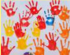
Annual 'Diwali for All' donation camp under the Community Connect Project. .... contd. page 2