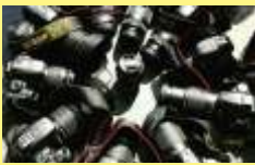
Educational cum Excursion tour to Mussoorie ..... contd. page 3