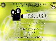
Upcoming Events ..... contd. page 4