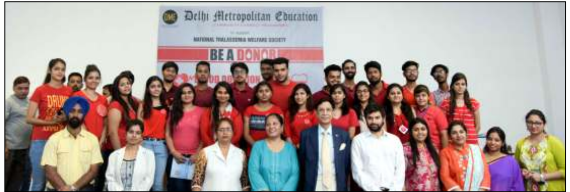
Vice-Chairman, Director General, Faculty Members and Students along with the team of NTWS

On October 3, Delhi Metropolitan Education observed the 'National Voluntary Blood Donation Day' with great fervour. As an initiative under the Community Connect Project , the blood donation camp was organised in the college premises to support the National Thalassemia Welfare Society (NTWS). The students of BJMC V Semester enthusiastically came forward to manage the event and convince other students in the college to support this noble cause.