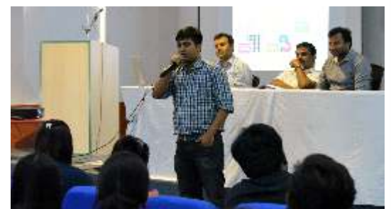
A member from Simply Digital addressing students