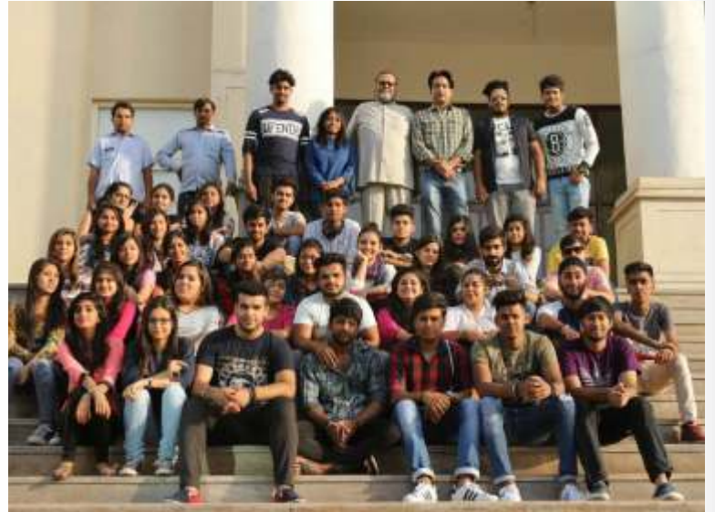
A group photograph of Principal Academics, Faculty members and students before leaving the campus for excursion to Mussoorie